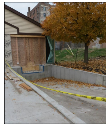
(Top left:) The roofed awning covering the entry-way to the main office. It faces Mulberry Street on the south side of the building. (Top right:) The reception area just inside the warehouse's east side entrance. (Bottom left:) The loading dock to the warehouse, also located on the east side of the building. It is recessed in order to accommodate large trailers. More photos are available online on the DMARC Facebook page.