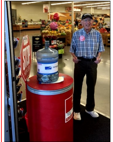
Des Moines, IA—On Saturday, July 18th, members of the West Des Moines Kiwanis held a Sack Saturday food drive at the Valley West Hy-Vee. They collected over $550 worth of food and cash donations to aid the DMARC Food Pantry Network. Meanwhile, across town, clients and staff of Mosaic collected donations at the Hy-Vee on East Euclid and the Price Chopper on Beaver & Franklin bringing in over $200 in food and cash.

Why not celebrate 13 years... with a baker's dozen?