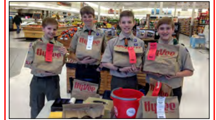
Above: Boy Scout Troop #46 of Windsor United Methodist Church held a Hunger Sack drive at the Hy-Vee in Windsor Heights on April 9th. The scouts bagged and sold 160 Hunger Sacks containing 940 food items.