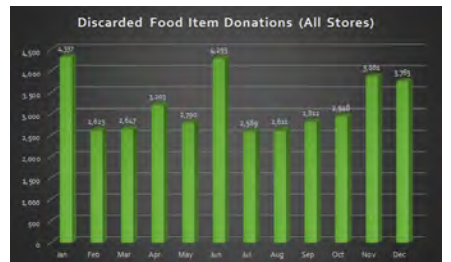
Perishable Food Item Donations in lbs. (All Stores)