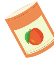
fruit canned in 100% juice