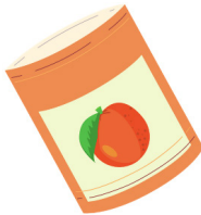
fruit canned in 100% juice