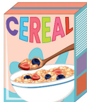
whole grain cereal

100 Army Post Road, Des Moines, IA 50315 515.277.6969 | dmarcunited.org