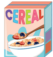
whole grain cereal

100 Army Post Road, Des Moines, IA 50315 515.277.6969 | dmarcunited.org